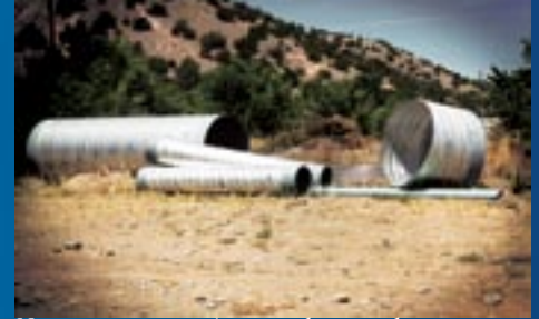
New stormwater pipes ready to replace degraded ones.

Legislators now recognize that grant funds appropriated to small systems in the past often provided only a temporary fix. As a result, state and federal sources are awarding fewer projects with larger